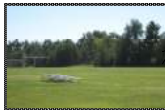
Football & Soccer Fields